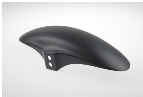
Abb. 2 – front fender „GT“