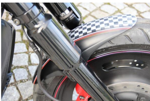
Abb. 1 – mounted front fender „GT“