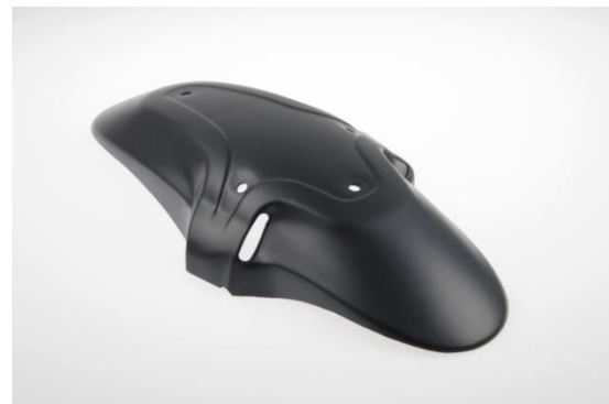
Abb. 2 – front fender "Special"