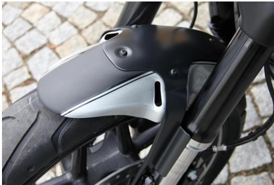
Abb. 1 - Mounted front fender

We recommend using a medium-strength screw lock (e.g. LOCTITE 243, blue) for all screws.