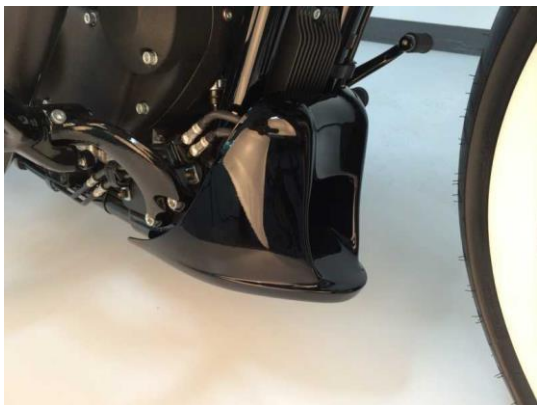
Abb. 1 – mounted bug spoiler

We recommend using a medium-strength screw lock (e.g. LOCTITE 243, blue) for all screws.