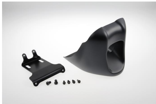
Abb. 2 – bug spoiler „Bobber“