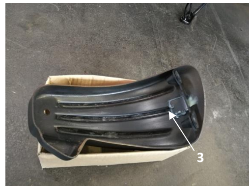
Abb.1, Side cover left