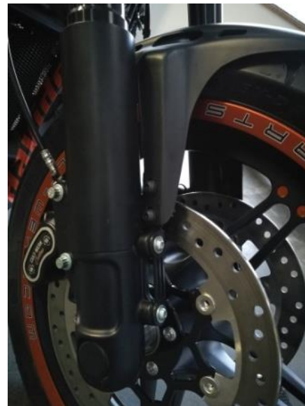
Abb.3 – Mounted front fender „Custom“