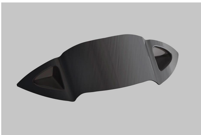
Abb. 2 – windscreen „Racing“