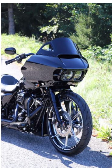
Abb. 1 – Mounted windscreen

We recommend using a medium-strength screw lock (e.g. LOCTITE 243, blue) for all screws.