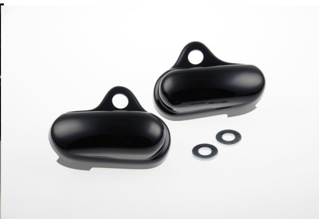
Abb. 2 – Rear axle cover