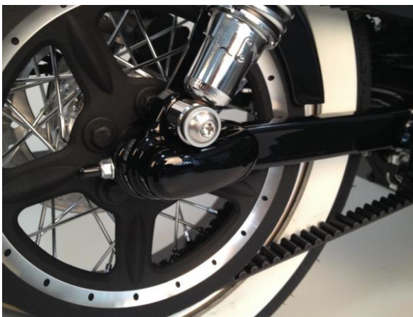
Abb. 1 – mounted axle cover

We recommend using a medium-strength screw lock (e.g. LOCTITE 243, blue) for all screws.